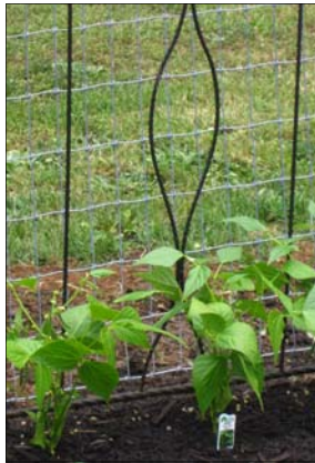
Bean plants off to a great start

The Woodscape Glen Organic Community Garden broke ground late this spring, and it is easy to see that it is thriving. Wildwood provided the land, soil, and mulch, as well as constructing a deer fence and irrigation line to support a garden space for Woodscape Glen residents. The participating