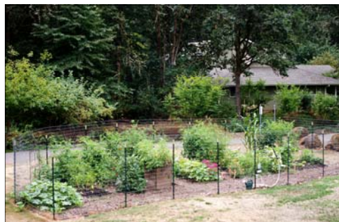
Woodscape Glen Community Garden in August

Garden should be submitted to the main office.